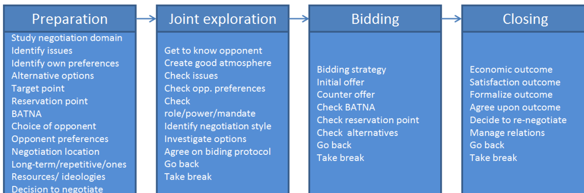
Figure 1a. Four negotiation phases with most of the important activities in each phase.